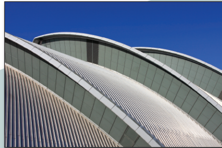
Right: Clyde Auditorium. The roof of this striking building, known affectionately as The Armadillo.