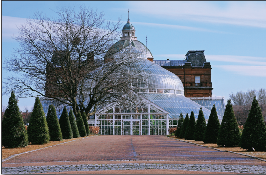
Above: The People's Palace, Glasgow Green