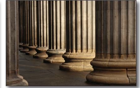
Top right: The frontage of the Gallery of Modern Art consists of a set of wonderful columns resembling an ancient Greek temple.