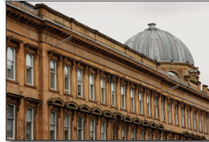
Above: Sauchiehall Street. More widely known for its shops, this famous street also has some wonderful architecture.